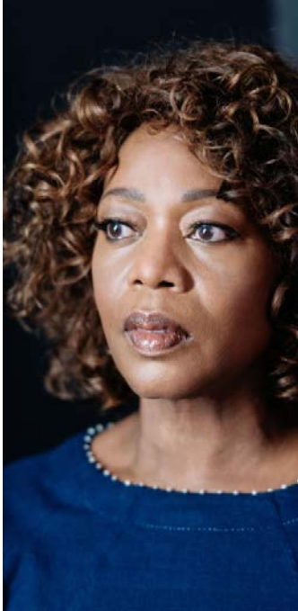
Lifetime Achievement Award Alfre Woodard