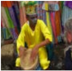
AfroLatinos: An Untaught Story

Other Special Screenings include; TANNA, based on a true story of young love against all odds; 93 DAYS, chronicles the little known story of a Nigerian couples work to stop the Ebola virus starring Danny Glover and Tim Reid, and AFROLATINOS: AN UNTAUGHT HISTORY, a documentary giving voice to communities throughout the Caribbean and South America and NETFLIX' A BURNING SANDS, on a hazing incident gone deadly wrong.